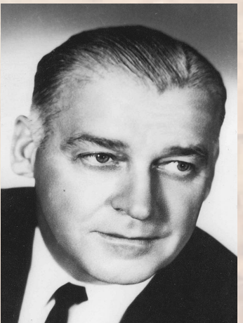
Governor Dennis J. Roberts